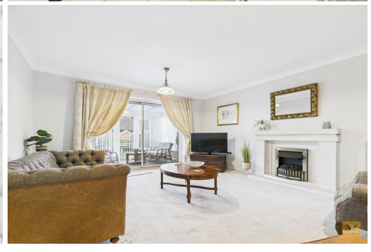
£375,000 Brookside Avenue, Offerton, Stockport, SK2 5HR